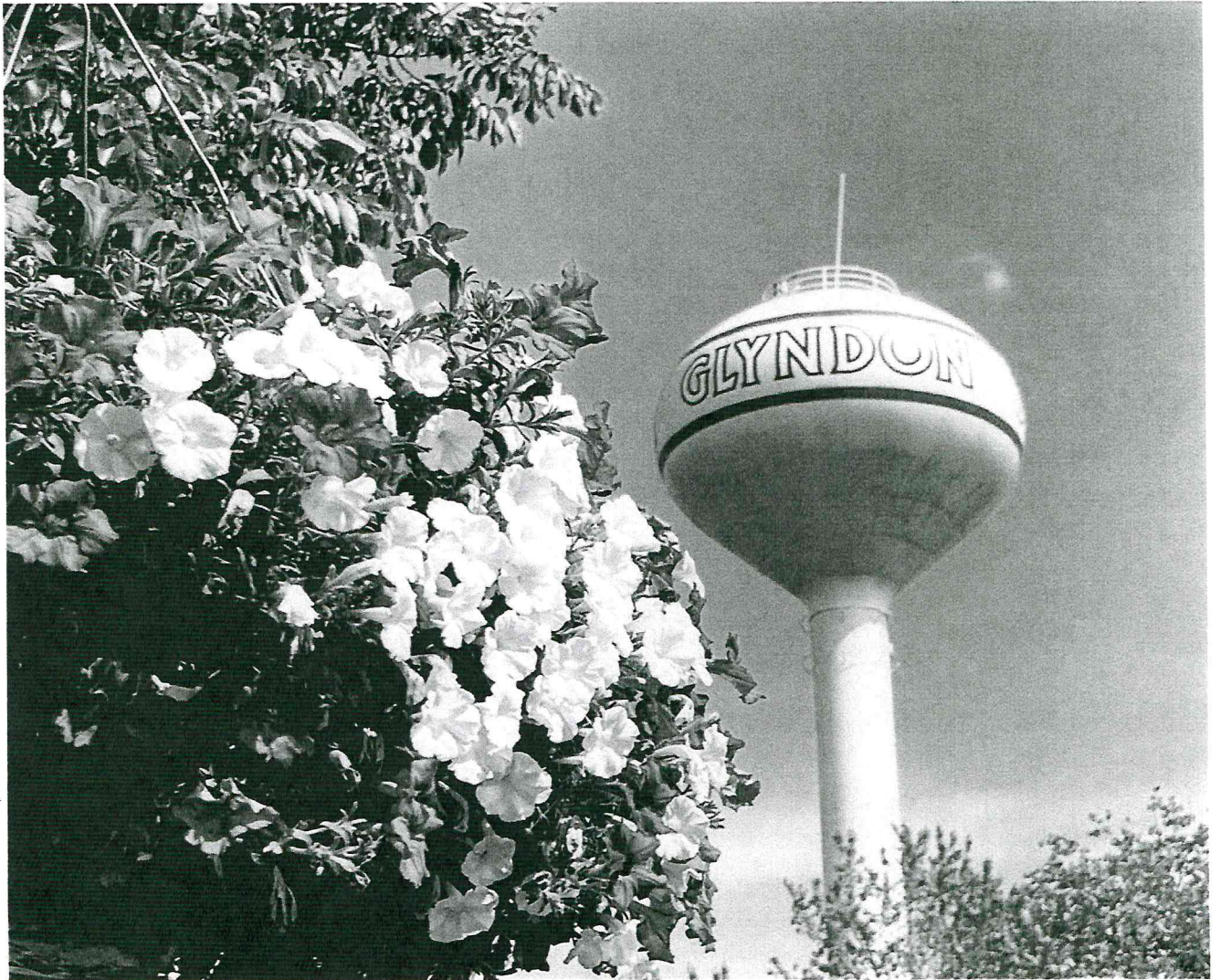
TRAVIS BRATON- PUBLIC WORKS SUPERINTENDENT-MARCH 21 ST , 2024